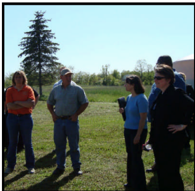
USDA Secretary Kathleen Merrigan touring Fusilier Family Farms in Manchester

Community leaders from across the FSEP service area convened in early 2010 to form the FSEP Policy Committee. The committee discussed broad goals such as a desire to be able to make informed statements about food policy issues, including food safety issues, and to recommend or influence policy changes that support small and local farmers, food entrepreneurs, and eaters, in southeastern Michigan. The committee decided to focus more specifically on three areas: