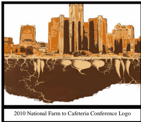
2010 National Farm to Cafeteria Conference Logo

The 2010 National Farm to Cafeteria Conference, held in Detroit Michigan, was a three day event bringing more than 750 people from all over the country together to connect and discuss farm to cafeteria programs for the greater good of their community. The conference, hosted by the National Farm to School Network is a collaborative effort of the Community Food Security Coalition and the Urban & Environmental Policy Institute. Workshops at the conference targeted farmers, food service directors, community members and facilitators by focusing on how to get local fresh food into more cafeterias. Cafeterias using local food may include schools, hospitals, daycares, colleges, universities and others. The conference also focused on the need for education and understanding of all aspects of the food system, from production on the farm, to distribution channels to the meals served. And many