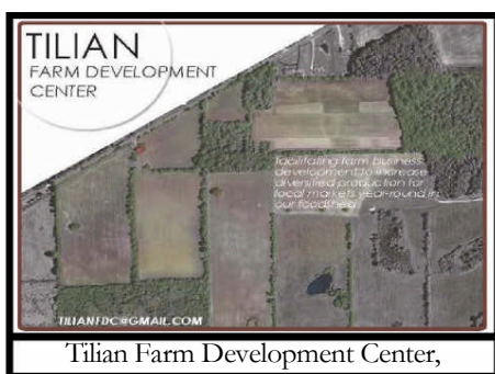
Tilian Farm Development Center,