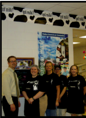
Concord Food Service Staff

The FSEP Farm to School program connects schools (K-12) and local farms with the objective of serving healthy meals in school cafeterias, improving student nutrition, providing agriculture, health and nutrition education opportunities, and supporting local and regional farmers. Although it may seem natural for locally grown produce to be incorporated into the cafeteria meal programs, there are often a number of obstacles both Food Service Directors and Farmers face in starting a Farm to School program. The FSEP Farm to Food Service Program Director acts as a third-party facilitator and helps both Farmers and Food Service Directors work through the regulatory environment, distribution and marketing challenges that arise.