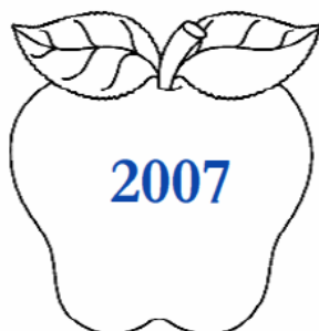
FSEP launched "pilot" Farm to School program in three school districts.