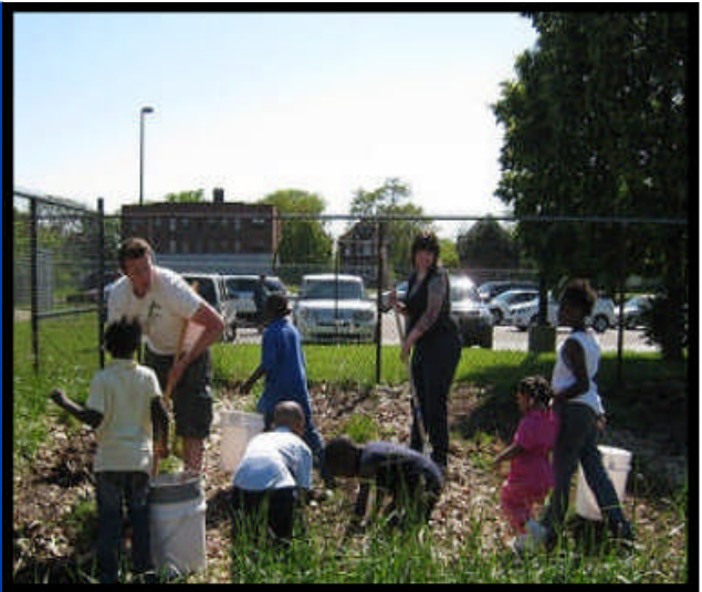
2010 National Farm to Cafeteria Conference Community Service Project